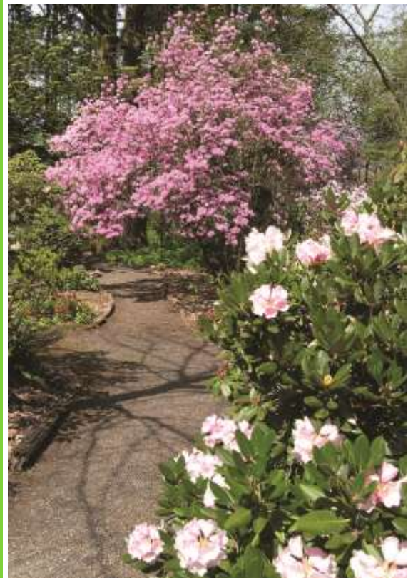
Smith Garden in Spring