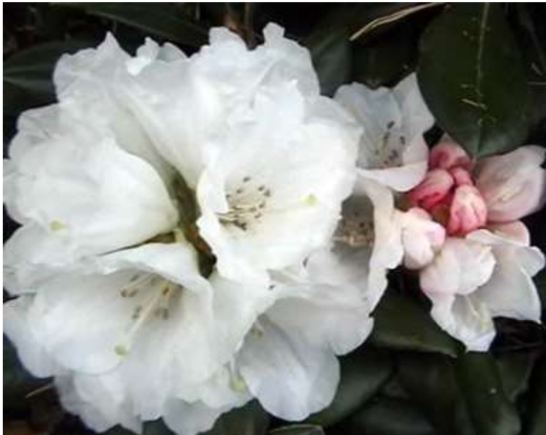
R. 'Cinnamon Bear'