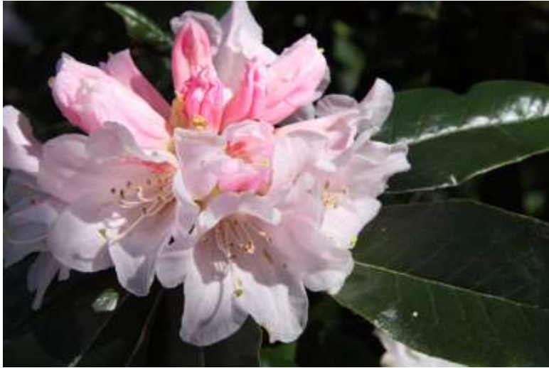
R. 'Teddy Bear'