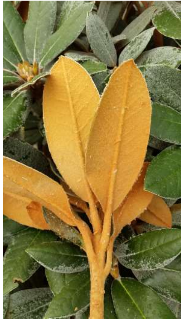
R. 'Silver Bear'