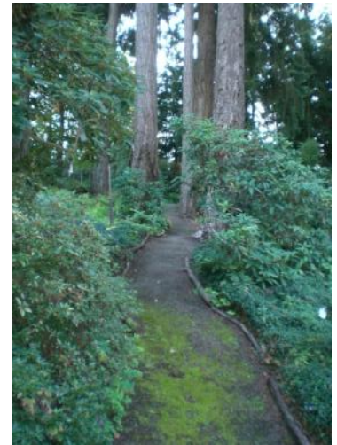
Smith Garden at the 2009 Soiree.

(Stay tuned for next month's article about more of the Smith Garden volunteers.)